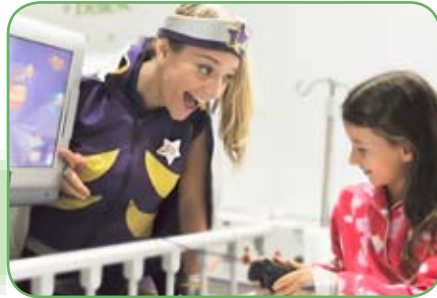
Captain Starlight brightening the day of a young child in the Starlight Express Room.

ALLclean is a proud sponsor of Starlight Children's Foundation. As part of our sponsorship we provide regular cleaning services to Starlight's West Perth office, as well as the Starlight Express Room and Club Ado, both located in Princess Margaret Hospital. The Starlight Express Room is known as a 'haven inside the hospital', where Captain Starlight provides a fun-filled, medical-free respite for children and their families. Club Ado gives hospitalised teens a dedicated space of their own with a wide variety of entertainment on offer.